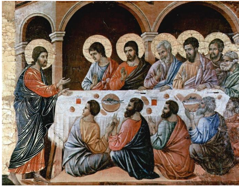
Christ Appears to the Disciples at the Table after the Resurrection

Sunday 18 th April 2021 at 10.30am ~ Worship Sheet